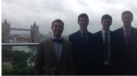
View of Tower Bridge from Marsh offices