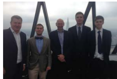
Lunch at top of The Gherkin with Swiss Re