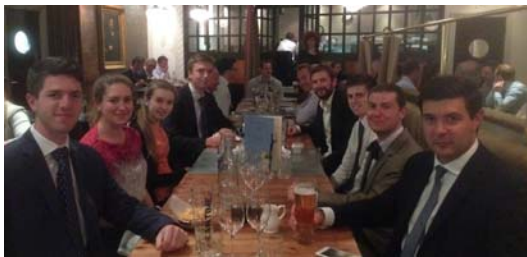
Lunch at The Factory House with Aon