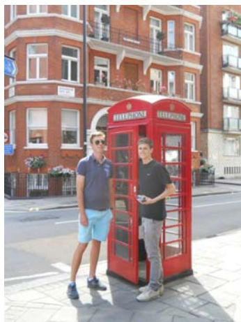
Red Phone Box