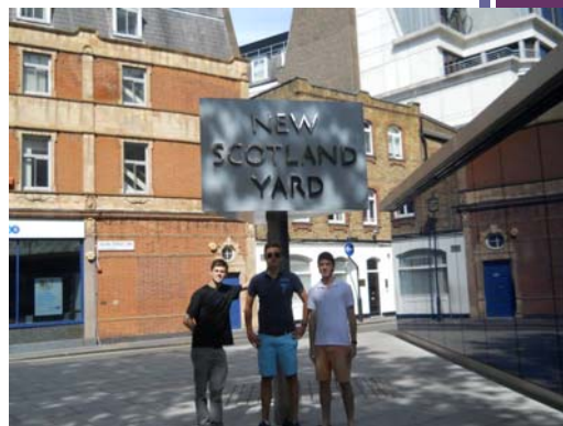
New Scotland Yard