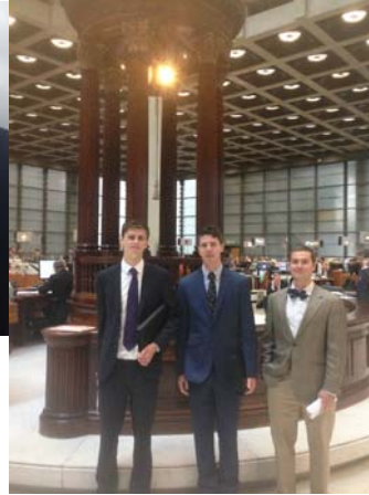
Lutine Bell in Llyod's