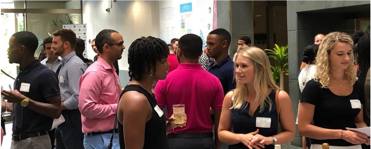
Professionals and students networking at the End-of-Summer Party

We are always most grateful to those companies that allow us to use their premises to host these events. Sincere thanks to AXA XL , KPMG and Aon for providing the venues.