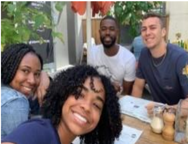
2019 London Interns

The group initially met up at the BFIS office to be briefed before flying to the UK to spend 2 busy weeks in London.