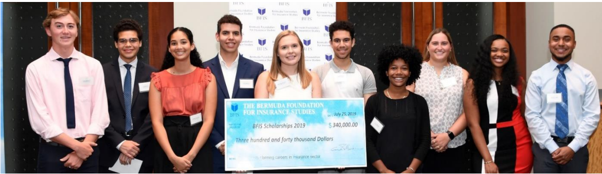
Large cheque presentation with 2019 BFIS scholars at Awards Reception

Once the April 30 deadline had passed we reviewed over 100 scholarship applications and 28 students were short-listed for interviews in June. As always, several students were outstanding, making the selection process difficult. A number of factors are taken into consideration – essays are carefully read and students’ career focus, community service, extra-curricular activities as well as financial need are all factored in when making decisions.