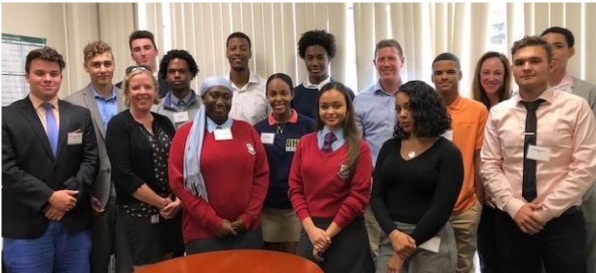
Students attend a Lunch & Learn with members of Schools Outreach Committee and other professionals

Then in February high school seniors can sign up to attend a week's series of speed networking events with different career focuses – Actuarial Science, Law and IT (Monday), Accounting & Finance (Wednesday) and General Insurance – Broking, Underwriting, Claims, etc. (Friday). Every school is invited to send up to 6 Junior/Senior year students to each session, which usually results in 100+ students benefiting from the opportunity.