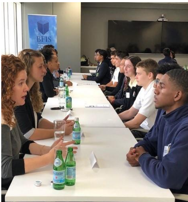
Students and professionals at a February 2019 Speed Networking event

Numerous professionals from various companies attend the sessions and enjoy chatting with keen young students interested in an insurance career. We usually get an excellent turnout with 20-25 professionals at each session and a larger number of students.