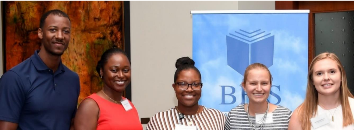
2019 Alumni Scholar (right) with Alumni Committee members