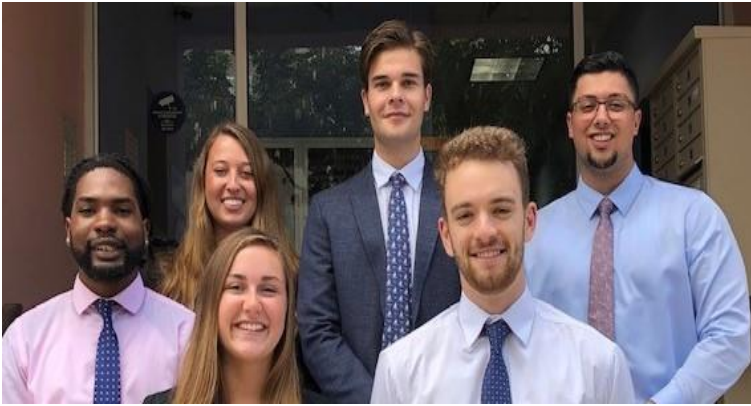
2019 Bermuda interns

None of the Bermuda interns were BFIS Scholars, one being a graduate with a degree in Kinesology, the other 3 still in college majoring in Business, Political Science and Economics.