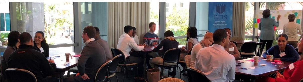
2018 BFIS Year-End Networking Event for Scholars and Professionals

A number of students said how much they enjoyed the different format as it made a change from the normal speed networking events that are held.