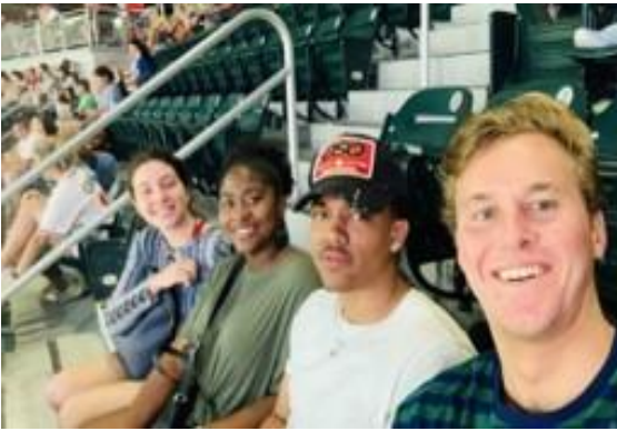
2019 Atlanta Interns

Participating companies were very welcoming and made a huge effort to host them. They greatly enjoyed learning about the Atlanta market and also took full advantage of the opportunity to network and explore Atlanta, enjoying a range of experiences, including World of Coca-Cola, a baseball game and the Aquarium. As one student put it: “I learned a huge amount about the industry which I knew little about before and can definitely see myself working in it in the future – I will be applying for underwriter trainee programmes.”