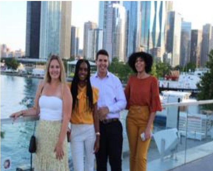
2019 Chicago Interns

Two of the Chicago interns were BFIS scholars, one having graduated from GSU with a degree in Insurance & Risk Management, the second at Queens studying Economics. The third student had graduated with a degree in IT, while the fourth was studying Communications and will graduate in 2020. The group hit it off immediately and quickly formed a cohesive team.