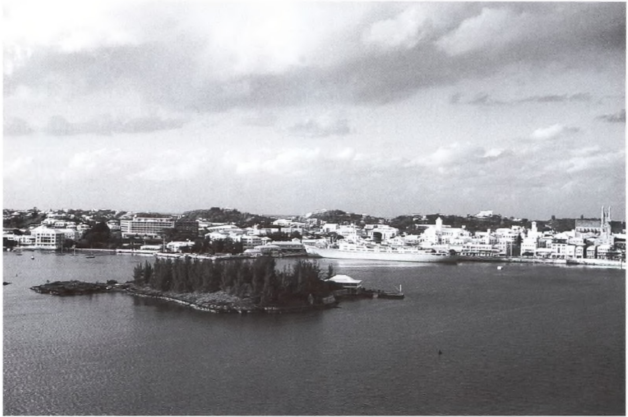
1962 photo of Front Street just as Fred Reiss was about to put Bermuda on the map