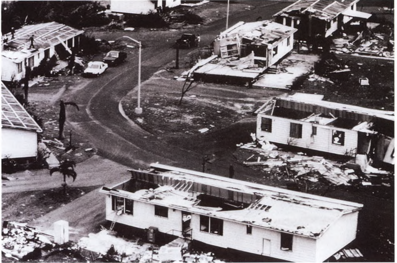
1980s Hurricane Hugo