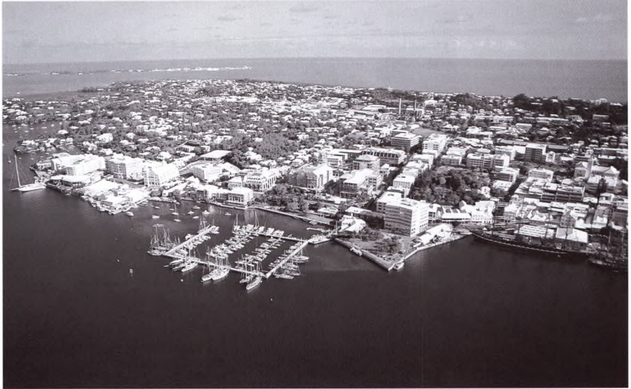
2001 Aerial view of Hamilton (photo courtesy of Scott Stallard, see also back cover)