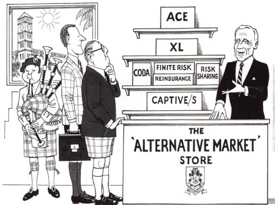
1990s 'One-stop-shopping' (cartoon courtesy of Brian Hall)