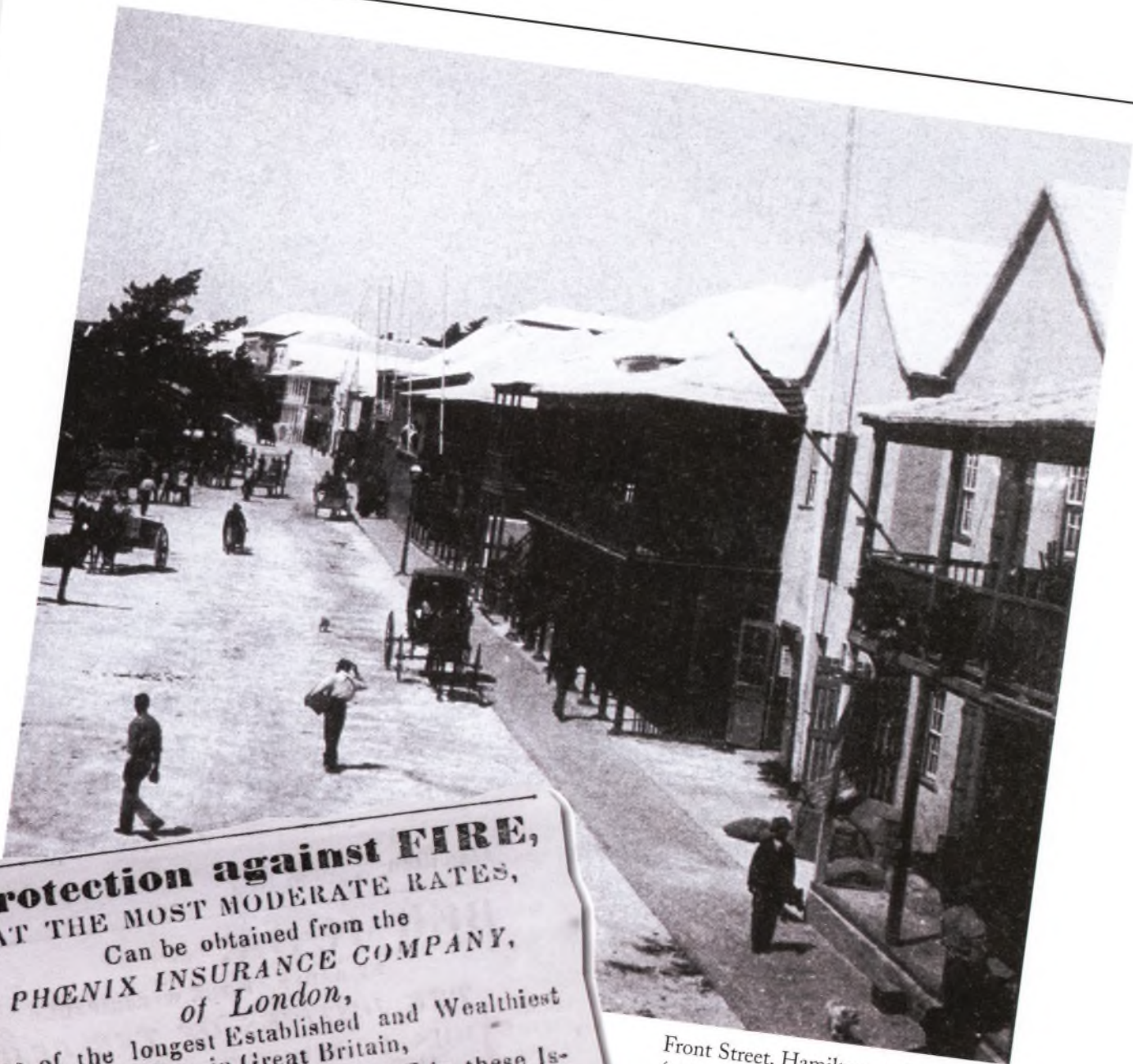
Front Street, Hamilton, early 1900s