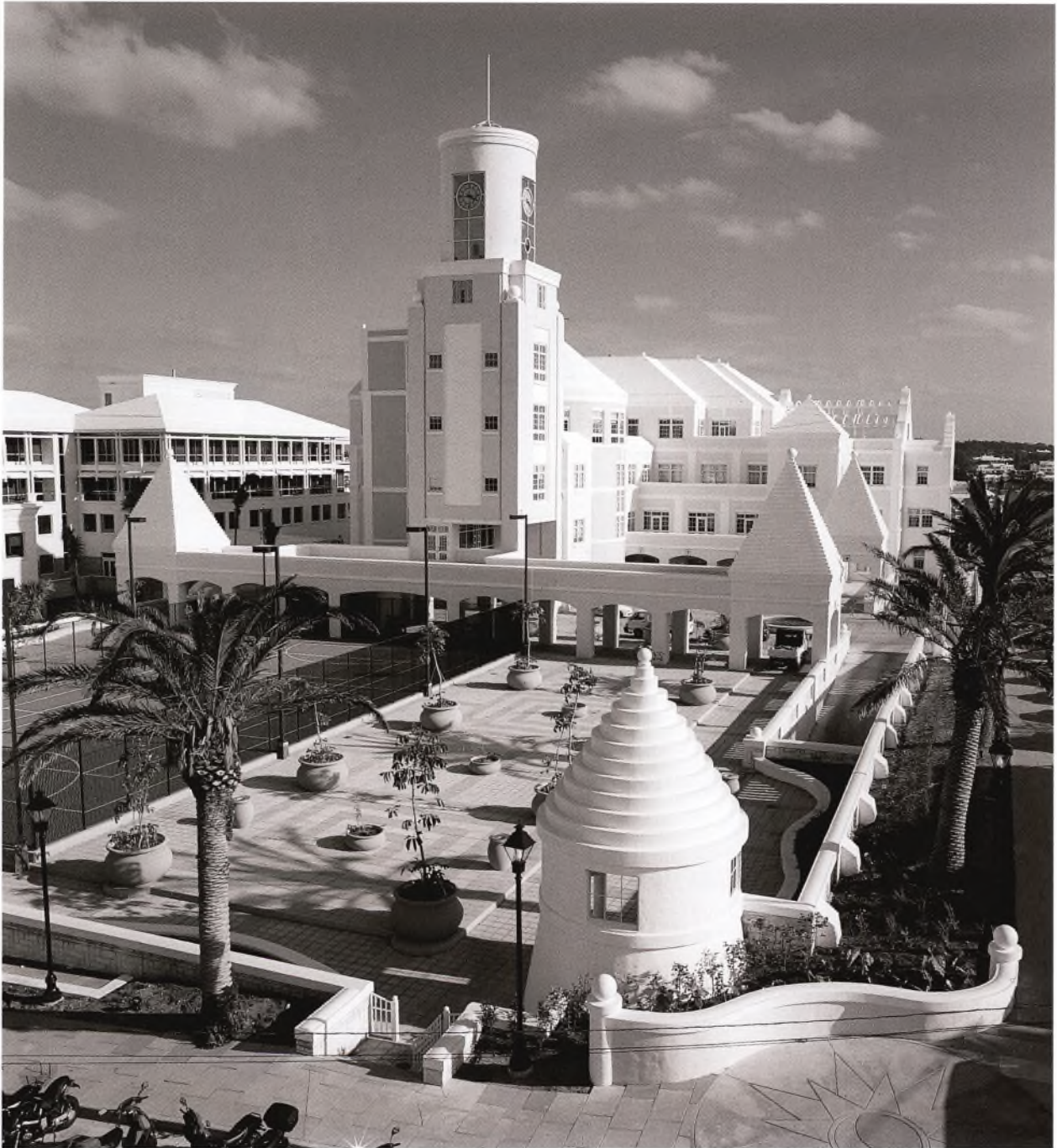
ACE and XL Buildings