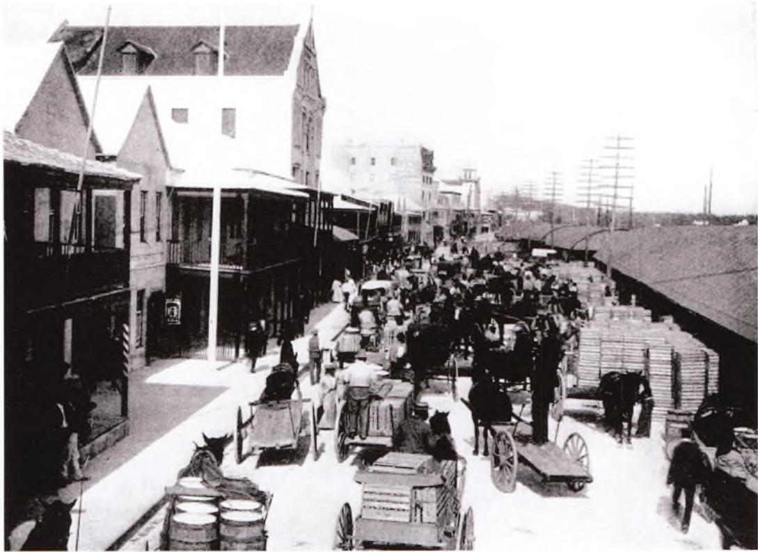
Early 1900s — the Event of the Week. Bringing onions to the steamer at Hamilton