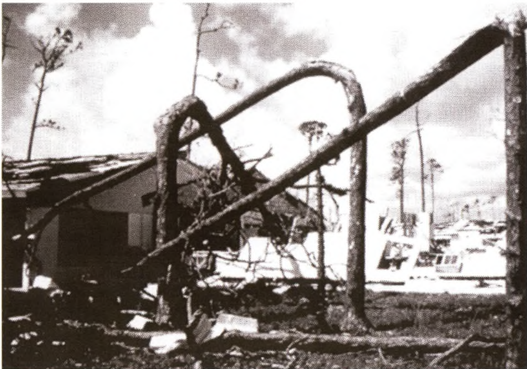
1990s Hurricane Andrew