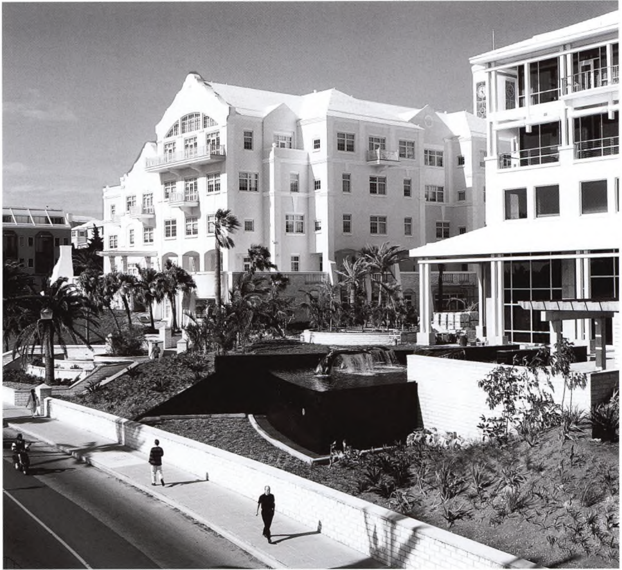
New XL Building in place of the former Bermudian Hotel