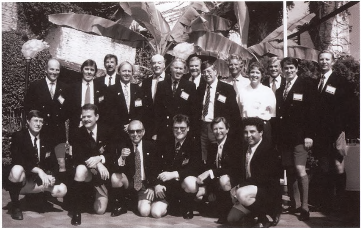
1990s A sampling of the Bermuda's market, brokers, accountants, reinsurers and some of the property cat reinsurers