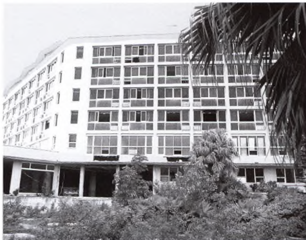
The derelict Bermudiana Hotel on Woodbourne Avenue