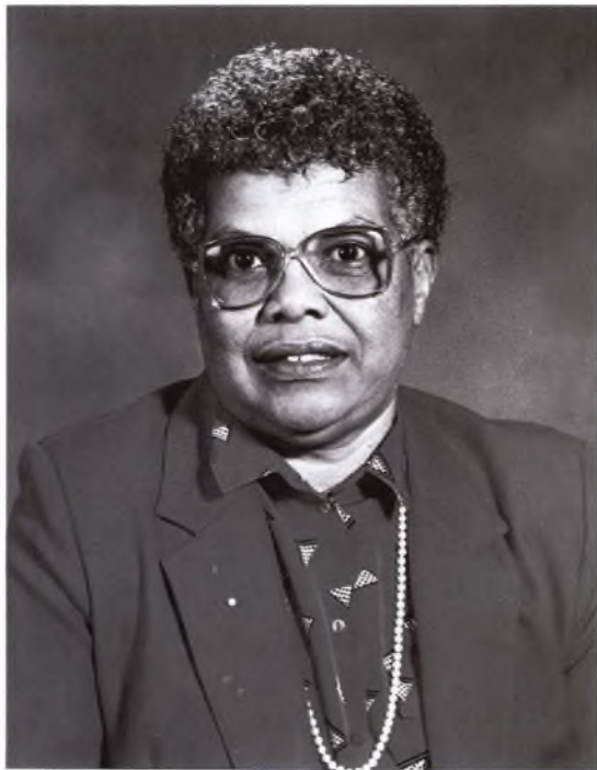
1980s Verbena Daniels — First and only woman Registrar of Companies